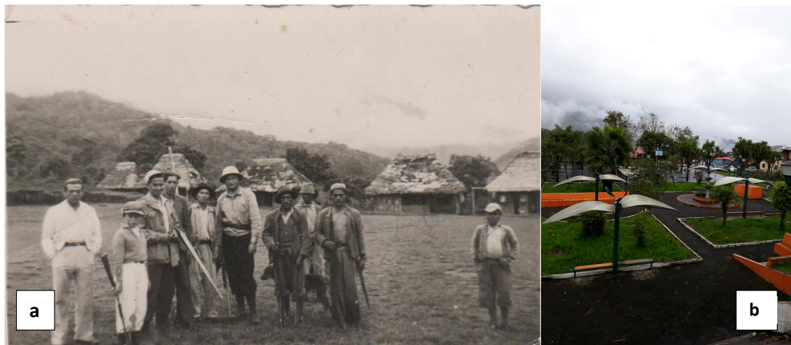
Figure 5. The left picture (a) shows the settlers and explorers in the central plaza of the old town of Baeza in 1950. Note the bare terrain and the huts as housing. On the right (b), the new plaza in 2020 with distinctive benches, electric posts, many trees, manicured gardens, paved roads, and traffic on the side road. Source (a) from Jack Rodríguez, Mar 1952. Source (b) from Jack Rodríguez, 22 September 2021.