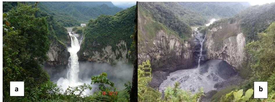
Figure 2. The San Rafael waterfall at the terminus of the Quijos river. (a) The left image is the historical flow and scenic beauty of the tallest waterfall in Ecuador. (b) The right image shows the change in the current flow that responded to natural causes of erosion; however, there are hints reflecting intensive manipulation of the riverine areas for the Coca-Codo Sinclair hydroelectric megaproject nearby. Source (a): Photo from Neotropical Montology Collaboratory, 16 December 2011. Source (b): Photo from Jack Rodríguez, 12 August 2021.