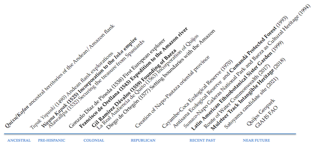
Figure 4. Timeline of the discovery and conservation efforts in the Quijos River valley in the Andean flank of the Ecuadorian Amazon, from prehistoric accounts to the historicity of the present, into the near future.

The timeline of the Quijos valley is shown in Figure 4, where the prominence of colonial explorations towards the Amazon rivalled those in the Colombian valleys and in the southern Ecuadorian mountain passes towards the Marañón River, as described by the French Geodesic Mission, who followed route maps of Salesian, Jesuits, Dominican, and Franciscan monks, who entered the Amazon with the first Spaniards. The fame of the Wamani pass became apparent when supplies of rich spices and tropical produce started flooding the vegetable markets of Quito residents, who soon appropriated the area of the “land of cinnamon” and claimed the “discovery” of the Amazon River to the world.