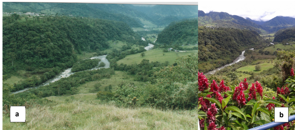
Figure 3. Panoramic view of the Quijos River at the mid-course level, near the town of Baeza at the Hostería Cumandá location, at the edge of Cumandá Protected Forest. (a) The left picture from 2010 shows the large isle that the white-waters course isolated in its rapid flow downslope. (b) In the picture on the right, taken in 2020, the isle is no longer visible in just one decade, due to human encroachment at the riverbank.

the abundant precipitation, leading to massive epiphytic gardens on the branches and exposed surfaces and waterlogging the soils [42]. Biologically, speciation is very active in this ridge-and-valley topography, where constant humidity produces cloudiness that enhances UV-β radiation, favoring mutation rate and stimulating speciation [25,42]. In Eastern Ecuador, there is one continuous cloud forest surrounding the city of Baeza. The high degree of biodiversity in the tropical montane cloud forest belt is impressive in almost every taxon [42,43]. A profusion of lauraceous trees with aroids, mosses, ferns, and orchids occurs mostly between 1800–2200 m, as an ecotonal height for the intermixing of both forest types, as predicted by Grubb’s classification [29], who compared lower (700–1800 m) and upper (1800–3400 m) montane forests in Tropicandean landscapes, as an intermediate zone of mid-elevation forests has been identified [30], where Cecropia sp., Ceroxylum alpinum and Dictyocaryum sp. are conspicuous (Figure 3).